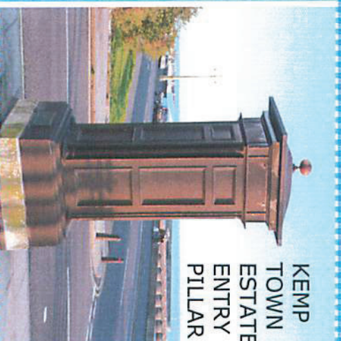
KEMP TOWN ESTATE ENTRY PILLAR